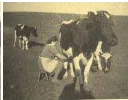
Granny milking a cow